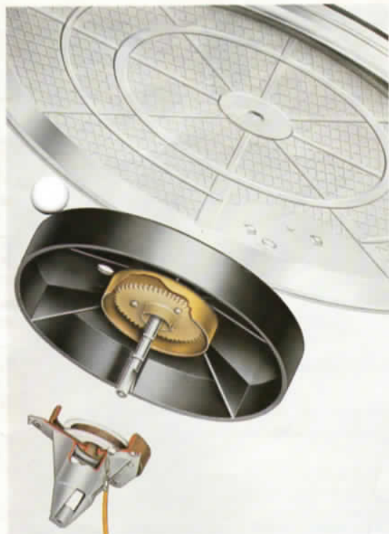
Exploded view of turntable assembly showing speed-sensing tachometer